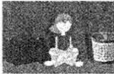
Missions at Blue Ridge